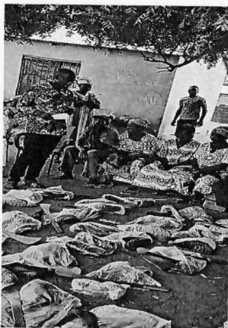
Figure 2: Presentation of Willington boats with cutlasses to community members