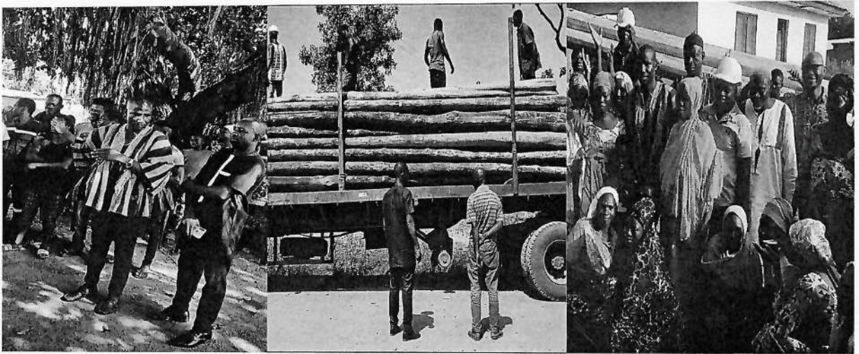
Figure 1. Interruptions with community members